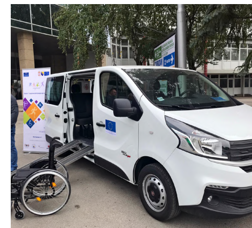
table tennis, while in Bosnia and Herzegovina the most award-winning sport is sitting volleyball. This project additionally improved the position of people with disabilities by supporting them in their daily sport activities and, simultaneously, their integration into society.

The project partners purchased 2 vans for the transport of athletes in wheelchairs and 18 sport wheelchairs. They also purchased the props required for table tennis and sitting volleyball and supporting equipment for players and referees. Simultaneously with the equipment purchase, the project partners organised a series of trainings on sensitizing sport workers and coaches to work with athletes with disabilities, whether they play sports professionally or as amateurs. Under the slogan “Be inspired!”, the project also promoted the necessity to improve the living and working conditions for this vulnerable category of population. The project partners also organised several promotional trainings in the cross-border area between Serbia and BiH, which promoted parasport and stressed its benefits.